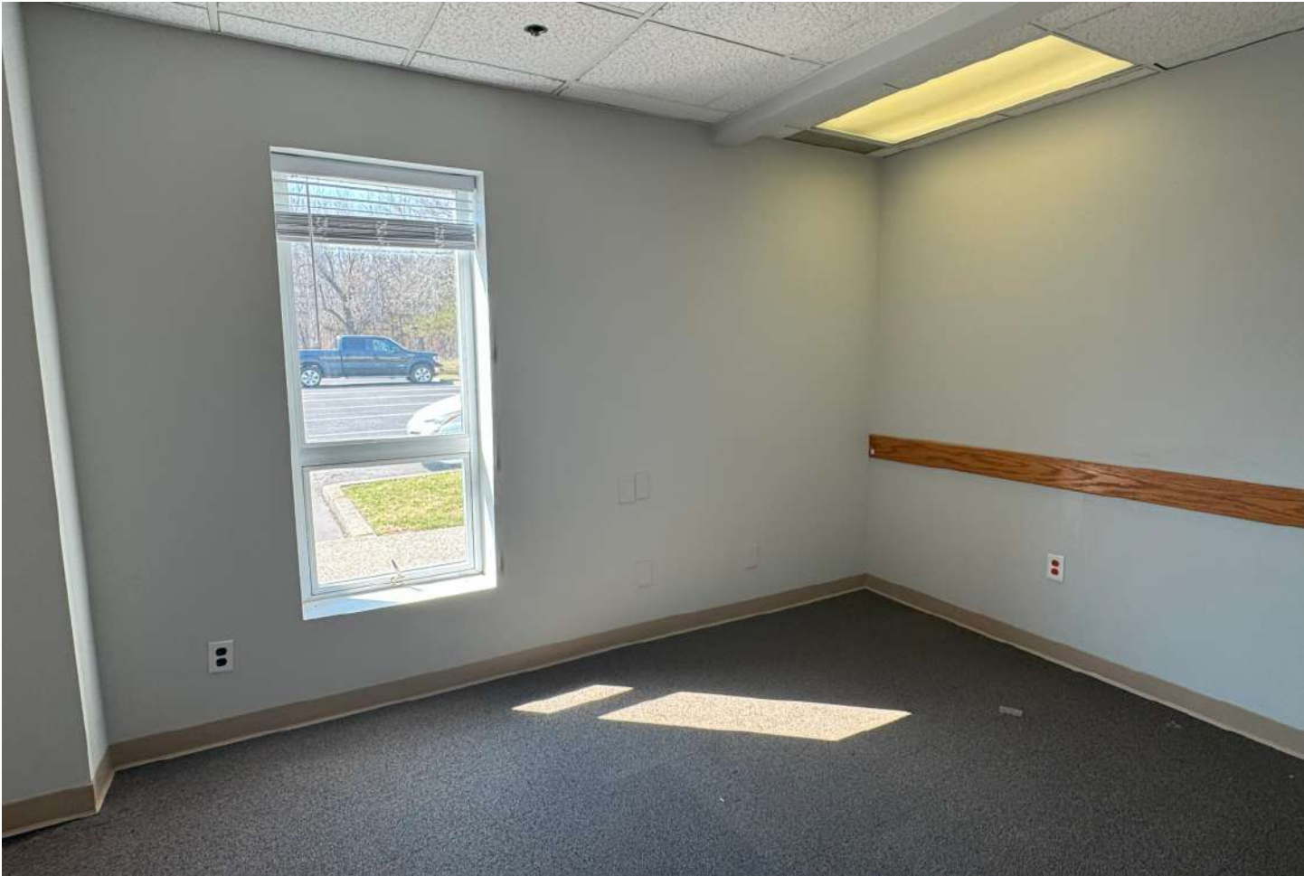
SUGGESTED USE - PRIVATE OFFICES