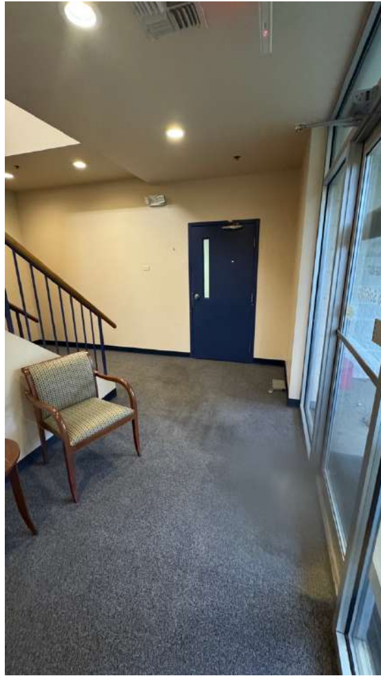
SUGGESTED USE - ENTRANCE